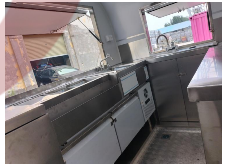
- Inside -