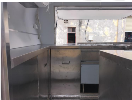
- Cocktail Station -