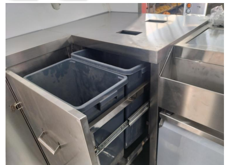
- Trash Cans -