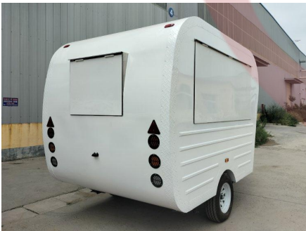
- Tail Lights -