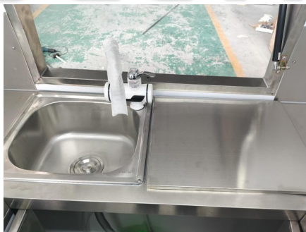
- Sinks -