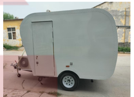
- Door -